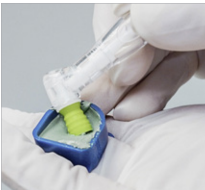
Special internal fins for easy pickup and targeted application of paste.