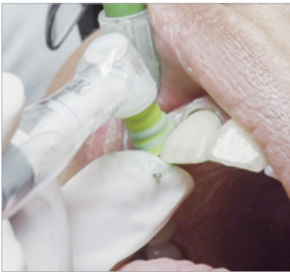
Nubs on the outside reduce splattering of the paste and polish the interdental space at the same time.