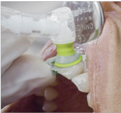
Smooth surface on the edge for gentle cleaning into the sulcus.

W&H offers the appropriate disposable prophy angles in various hardness levels for the Proxeo Twist Cordless Polishing System. They were designed in consultation with Prophy users. Great emphasis was placed on features such as optimal adaptation, simple paste pickup and distribution as well as gentle cleaning into the sulcus.