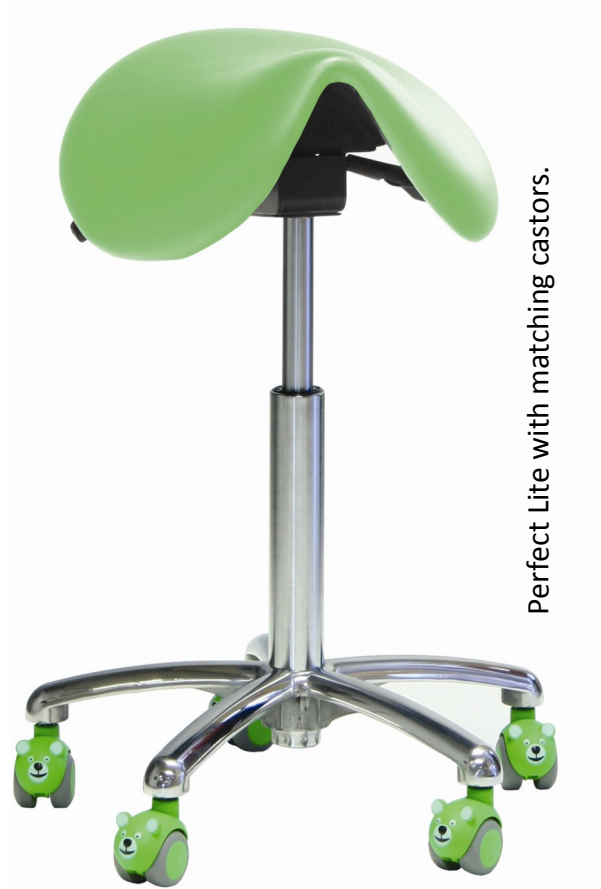
Perfect Lite with matching castors.

You can colour match your new chair with smiling animals and air-plane.